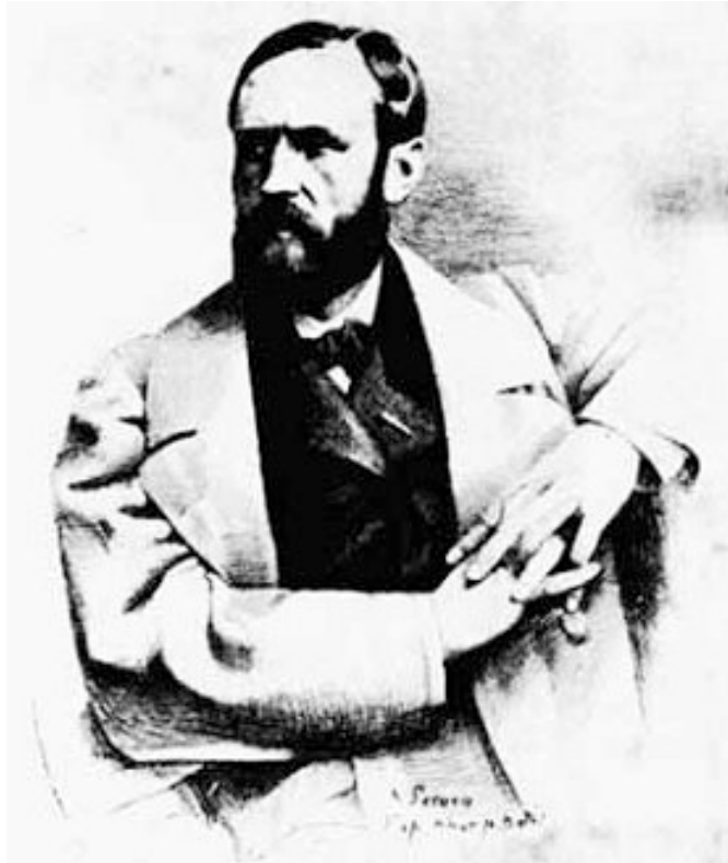
Louis-James-Alfred Lefebure-Wély, vers 1860.

Nouvelle édition et gravure par Pierre Gouin.